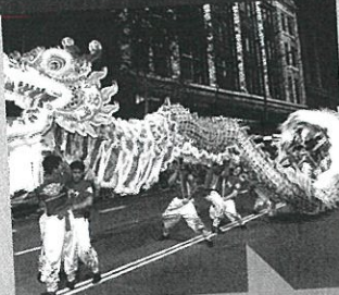
Chinese New Year January or February

Chinese people celebrate the lunar new year with fireworks and dragon dances.