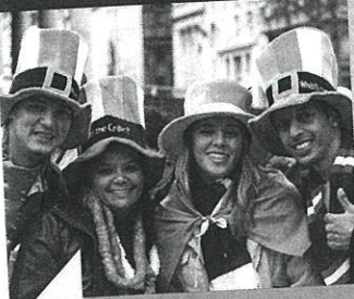
Saint Patrick's Day March 17th

People of Irish background wear green to celebrate their culture with parades, dancing, parties, and special foods.