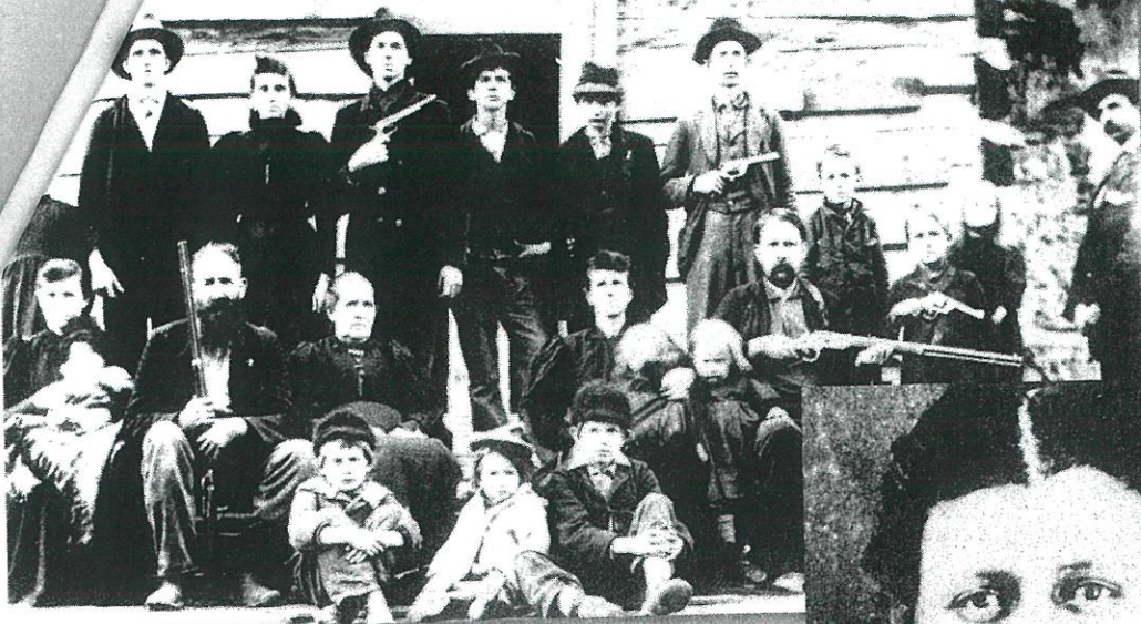
1. The Hatfields